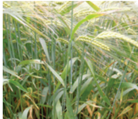
Bontima 2.0 l/ha