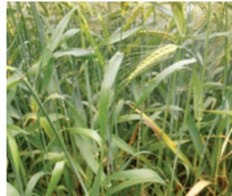
Siltra Xpro 1.0 l/ha

Source: SAC 2011. Applic: GS31/32 (18/04) fb GS39 (04/05)